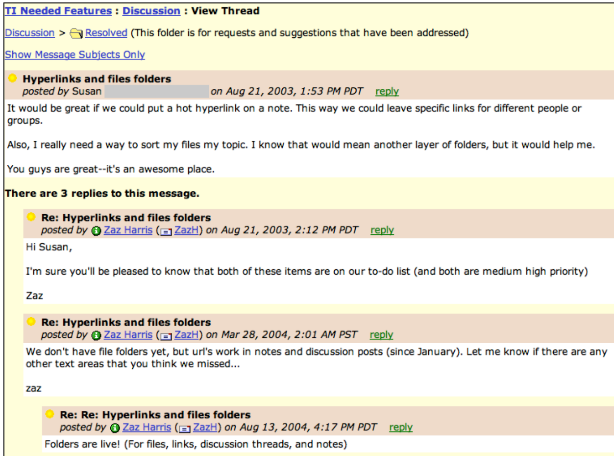
Figure 2. A discussion thread in the TI Needed Features group room, showing a request for foldering and hyperlinks.

The second example (see Figure 3) comes from several prominent Tapped In community members, emphasizing the need for being able to create K-12 student groups. This example demonstrates the open lines of communication between users and the design team and illustrates that the urgency of the needs of these users is taken into account when prioritizing and implementing features and enhancements to the system.