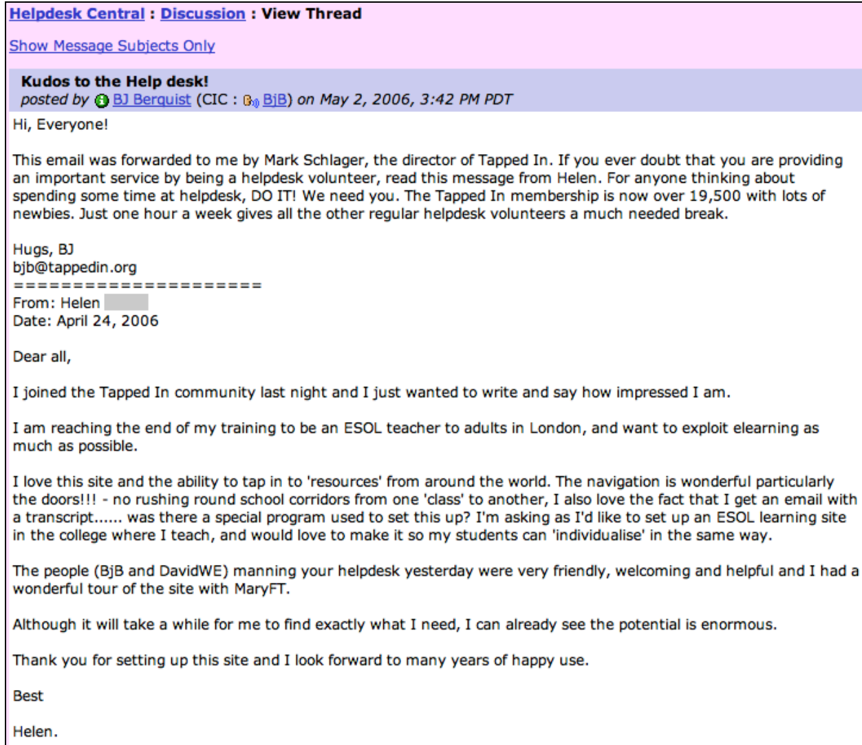
Figure 4. An example of positive feedback flowing through the close-knit Tapped In team and volunteer Help Desk community.

The Help Desk volunteers are so much a part of the design cycle and so in tune with the community that they recently (October 2005) noticed a slight decrease in ASO session attendance and alerted Tapped In staff. Tapped In staff called a meeting of all interested members and held a brainstorming session about what could be done. Some members hypothesized that new technologies (e.g., audio or video capabilities, blogging tools, or a new look and feel) might make Tapped In more useful and interesting to members. Others thought that Tapped In was just fine as it was, but that more outreach needed to be done by staff and volunteers. The solution will most likely require social infrastructure improvement, but new technologies also might help. The important thing is that through the mechanisms we have set up, developed, and allowed to grow organically, the community brings these issues to the attention of the Tapped In staff as they arise.